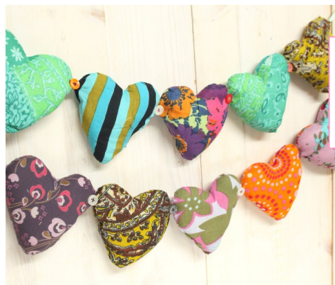
Fairtrade Patchwork Heart Strings